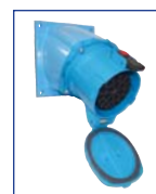
Female Receptacle with Angle Adapter 17-64200 + MA10