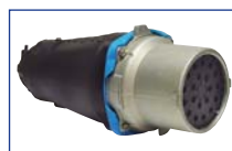
Male Inlet with Handle (Plug) 17-68200 + 65-9A013-D25

A typical order should include an inlet part number, a receptacle part number AND the matching handles, angles or other required accessories.